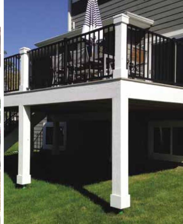
DECKS / PORCHES