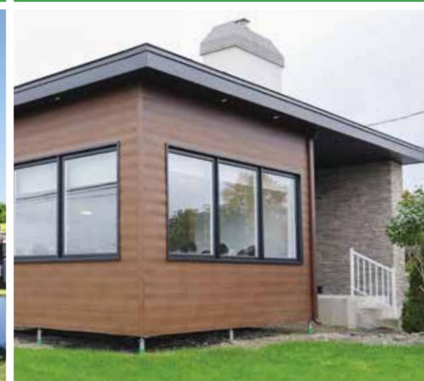
SOLARIUMS / ADDITIONS