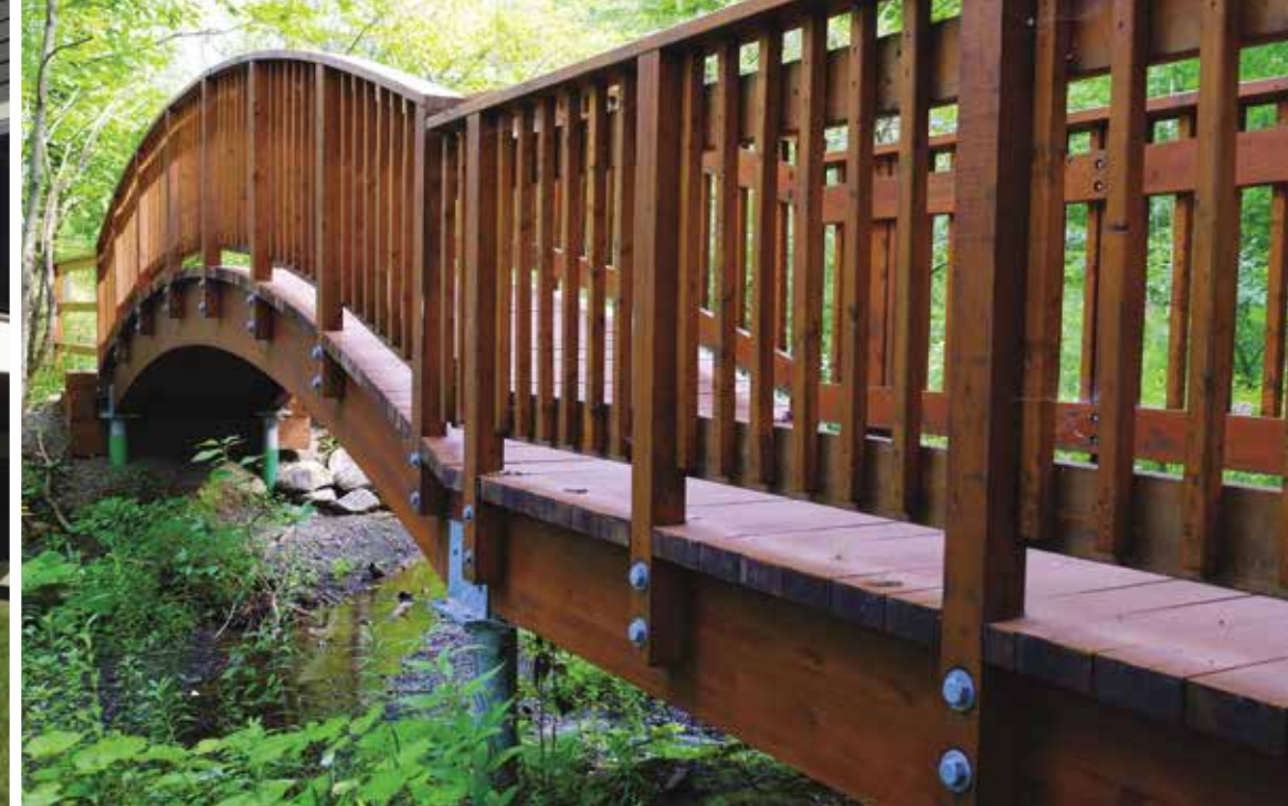
FOOTBRIDGES / TRAILS / BOARDWALKS