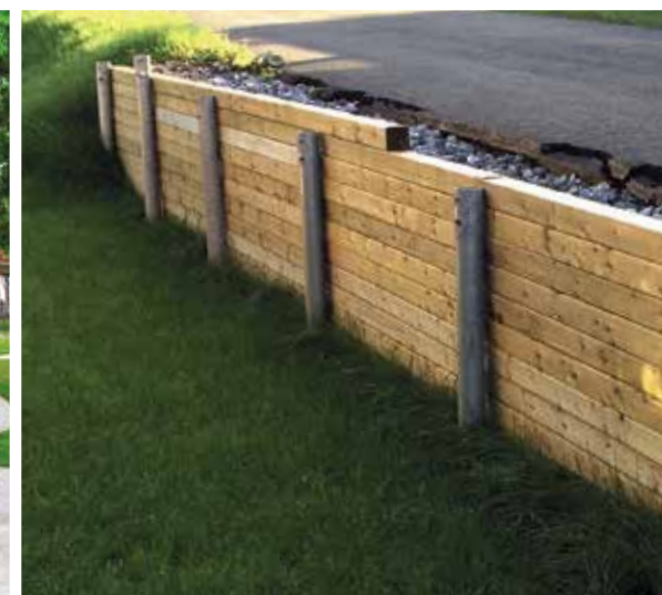
FENCES / RETAINING WALLS