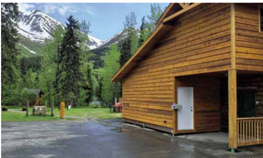
COTTAGES / HOUSES / BUILDINGS